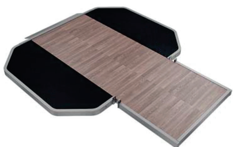
FR-872.3 INSERT PLATFORM FOR NON-STANDARD POWER CAGES

DIMENSIONS (LxWxH), cm: 305x249x7,7 MACHINE WEIGHT, kg: 317