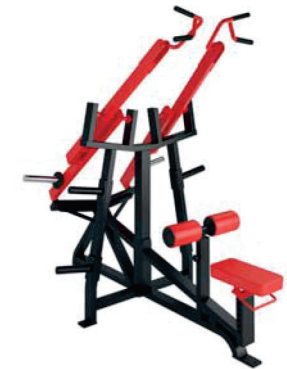
FG-608 LAT PULL DOWN

DIMENSIONS (LxWxH), cm: 205x136x198 MACHINE WEIGHT, kg: 140