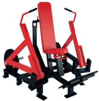
FG-609 SEATED CHEST PRESS

DIMENSIONS (LxWxH), cm: 154x137x140v MACHINE WEIGHT, kg: 120 MACHINE WEIGHT, kg: 145