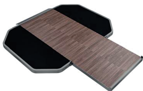
FR-872.2 INSERT PLATFORM FOR POWER CAGE

DIMENSIONS (LxWxH), cm: 223x249x8,5 MACHINE WEIGHT, kg: 280