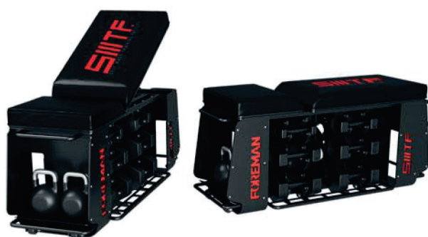
FY-1055.15 BENCH FOR 8 PAIRS

DIMENSIONS (LxWxH), cm: 124x43x57 MACHINE WEIGHT, kg:69