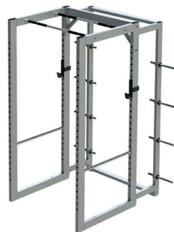
FW-807 POWER CAGE

DIMENSIONS (LxWxH), cm: 170x125x170 MACHINE WEIGHT, kg: 117