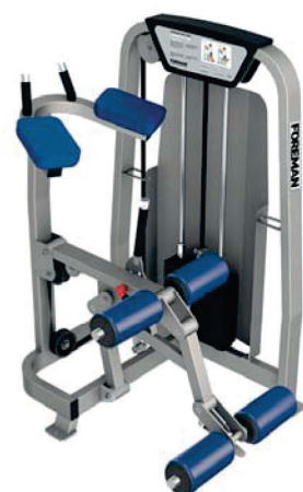
FS-104 STANDING LEG CURL

DIMENSIONS (LxWxH), cm: 125x80x140 MACHINE WEIGHT, kg: 190 STACK WEIGHT, kg: 68