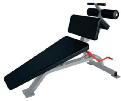
FW-512 AB CRUNCH EASY BENCH

DIMENSIONS (LxWxH), cm: 156x61x102 MACHINE WEIGHT, kg: 68