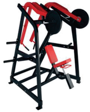
FG-602 SEATED ROW

DIMENSIONS (LxWxH), cm: 153x178x197 MACHINE WEIGHT, kg: 203