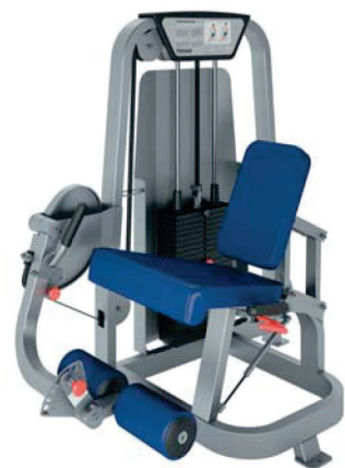
FS-101 LEG EXTENSION

DIMENSIONS (LxWxH), cm: 140x90x140 MACHINE WEIGHT, kg: 218 STACK WEIGHT, kg: 113