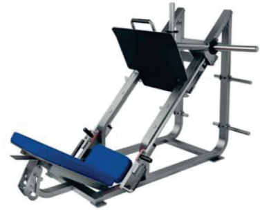
FP-105 LEG PRESS

DIMENSIONS (LxWxH), cm: 196x173x133 MACHINE WEIGHT, kg: 213