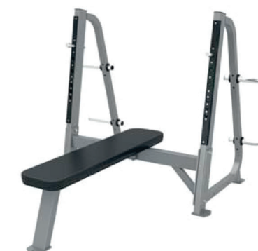
FW-411 OLYMPIC INCLINE BENCH

DIMENSIONS (LxWxH), cm: 178x176x140 MACHINE WEIGHT, kg: 95