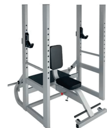
FW-413 OLYMPIC MILITARY BENCH

DIMENSIONS (LxWxH), cm: 200x176x139 MACHINE WEIGHT, kg: 121