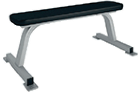
FW-701 FLAT BENCH

DIMENSIONS (LxWxH), cm: 120x60x50 MACHINE WEIGHT, kg: 33