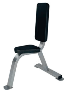
FW-703 UTILITY BENCH

DIMENSIONS (LxWxH), cm: 80x60x92 MACHINE WEIGHT, kg: 16