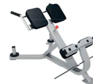
FW-311 HORIZONTAL BACK EXTENSION

DIMENSIONS (LxWxH), cm: 116x88x72 MACHINE WEIGHT, kg: 44