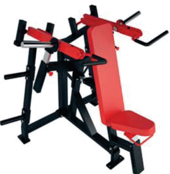
FG-610 HOULDER PRESS

DIMENSIONS (LxWxH), cm: 128x154x136 MACHINE WEIGHT, kg: 116