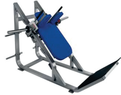
FP-106 HACK SQUAT

DIMENSIONS (LxWxH), cm: 196x173x133 MACHINE WEIGHT, kg: 213