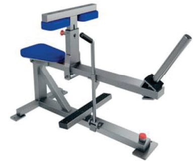
FP-111 SEATED CALF

DIMENSIONS (LxWxH), cm: 193x173x133 MACHINE WEIGHT, kg: 211