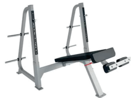
FW-412 OLYMPIC DECLINE BENCH

DIMENSIONS (LxWxH), cm: 200x176x139 MACHINE WEIGHT, kg: 121