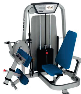
FS-102 SEATED LEG CURL

DIMENSIONS (LxWxH), cm: 146x80x140 MACHINE WEIGHT, kg: 210 STACK WEIGHT, kg: 96