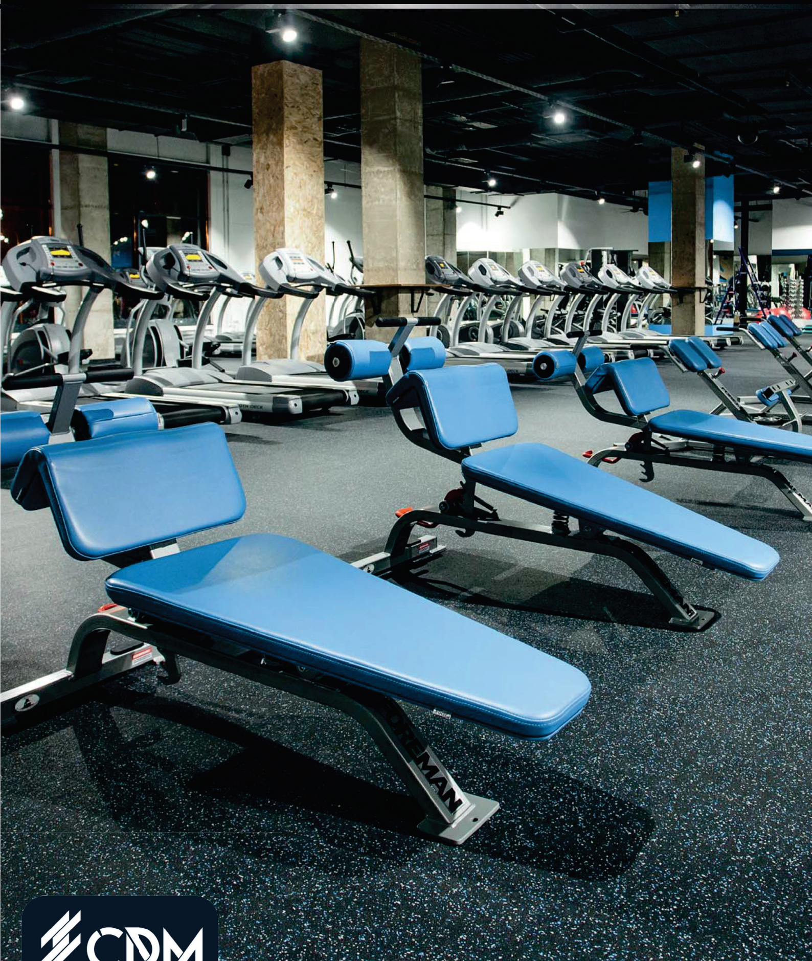
FW-115 GLUTE BENCH

DIMENSIONS (LxWxH), cm: 207x101x140 MACHINE WEIGHT, kg: 110