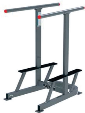
FW-815 FREE STANDING DIP

DIMENSIONS (LxWxH), cm: 150x75x134 MACHINE WEIGHT, kg: 55