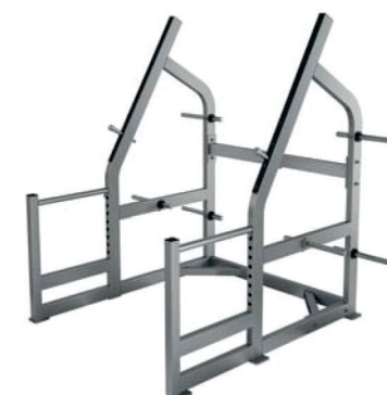
FW-819 SQUAT RACK

DIMENSIONS (LxWxH), cm: 143x174x239 MACHINE WEIGHT, kg: 208