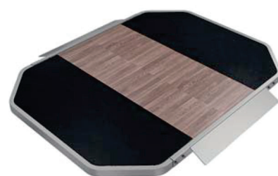
FR-872.1 LIFTING PLATFORM

DIMENSIONS (LxWxH), cm: 150x75x134 MACHINE WEIGHT, kg: 55