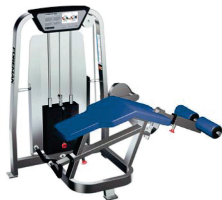
FS-103 LYING LEG CURL

DIMENSIONS (LxWxH), cm: 88x177x140 MACHINE WEIGHT, kg: 221 STACK WEIGHT, kg: 96